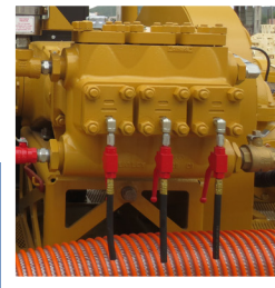
High Pressure Triplex Pump