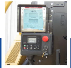
Operator's Control Station