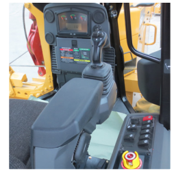
Integrated Sideboom Controls

Electrohydraulic boom stop automatically prevents system over travel and damage to boom.