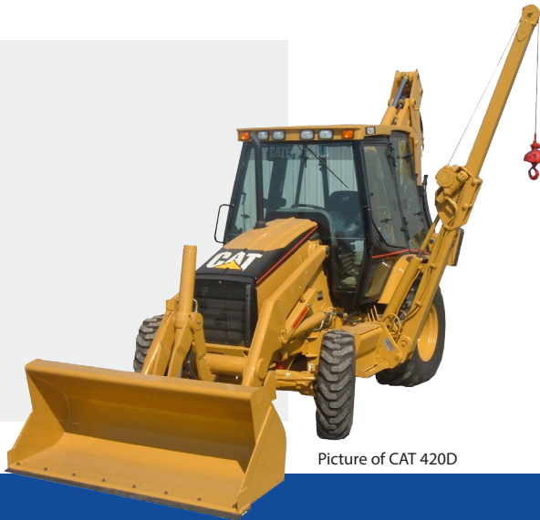
Picture of CAT 420D