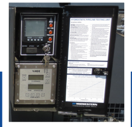
Operator's Control Station