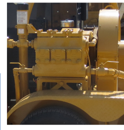
High Pressure Triplex Pump