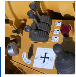
Integrated Sideboom Controls